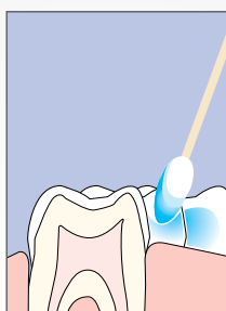
Fig 2. Swab Zarosen onto the tooth